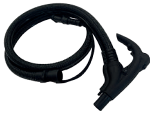
Steam/vacuum handle grip