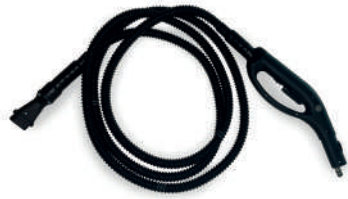
Steam-only handle/grip see page 5